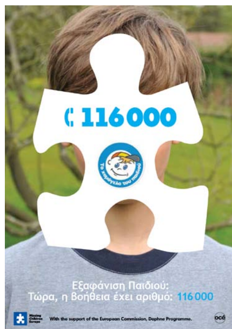
Greek version of the poster produced by MCE