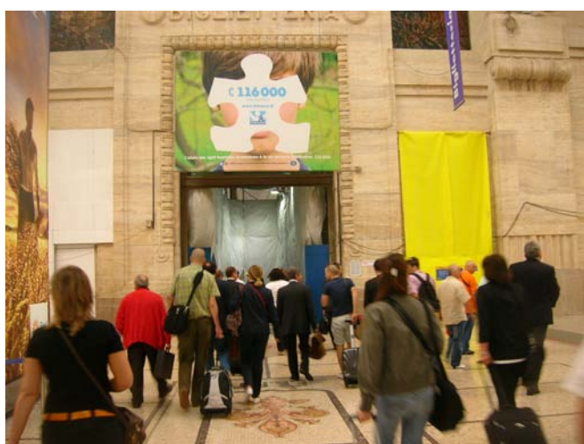
116 000 campaign in Rome

The 116 000 communication campaign was launched simultaneously in 10 EU Member States 56 on International Missing Children's Day, which is commemorated annually across Europe on 25 May. The campaign ran for several months and included the organisation of national press conferences as well as the dissemination of posters, flyers, bracelets and stickers and the creation of a dedicated website: www.hotline116000.eu .